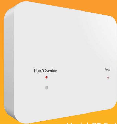
Model: RF-Switch 16A